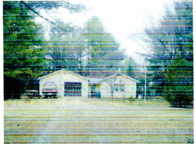
( https://images.vgsi.com/photos/MonmouthMEPhotos/\00\00\04\98.jpg )